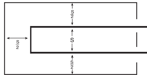
Ceiling of protected area S=Listed spacing. See chart below.

In general, the use of Protectowire in any initiating device circuit, is limited to coverage of a specific hazard or area. Copper wire, of an approved type, with a minimum conductor size of 18 AWG, shall be installed from the control panel out to the hazard area where it is then connected to the beginning of the Protectowire portion of the circuit. The Protectowire portion of each initiating circuit shall begin and terminate at each end in an approved zone box or end-of-line zone box. SR-502 Series, Strain Relief Connectors, shall be installed in all zone boxes where Protectowire enters or exits the enclosure, in order to hold the cable securely.