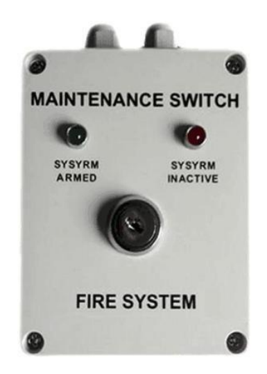
FIGURE 1. PRODUCT PICTURE

This MAINTENANCE panel is a key switch, which disconnects actuation circuits in the system to prevent accidental discharge during maintenance operations.